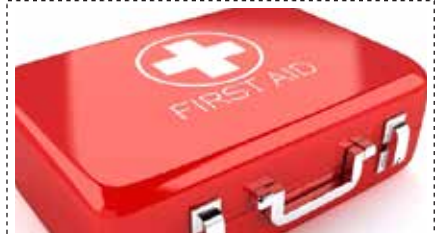
First Aid Kits