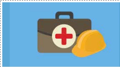
First Aid Requirements