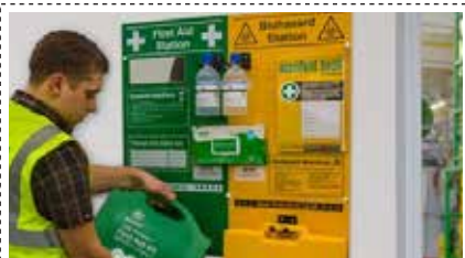
First Aid Stations