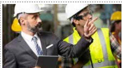
Safety Supervisor Obligations