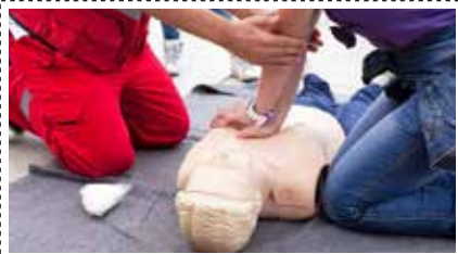
First Aid and CPR Training

Following procedures will be followed for medical facilities and personnel to provide prompt attention to the injured. The telephone numbers of physicians or Male Nurse (As Per Project Requirements), hospitals, or ambulances shall be posted (these numbers shall be posted at project site office). We have adopted this program in order to implement 29 CFR 1910.151, the OSHA standard regulating Medical Services and First Aid.